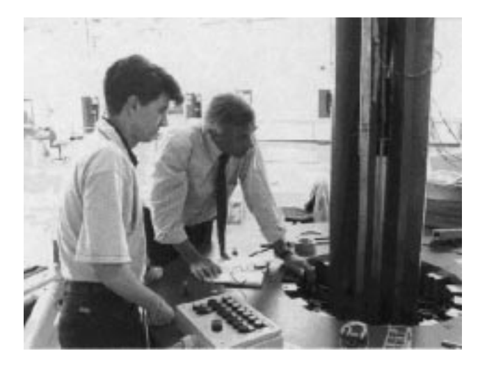
Fig. 3. New collaring press operating for first mock-up test in fabrication hall. A hole in the ground provides the vertical passage of the collared coils.

a brand new fabrication facility. ACCEL has already started setting up its procedures by making a number of test and operational trials. They can rely to a high extent on the experience